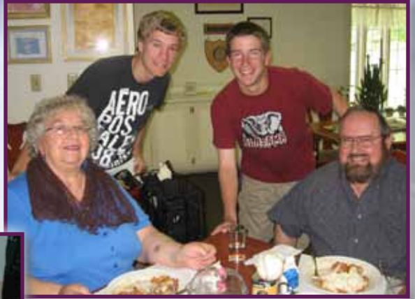
Baseball season had begun in May of 2010, when members of the Sun Prairie High School Baseball team joined participants for an early morning breakfast and some baseball talk.