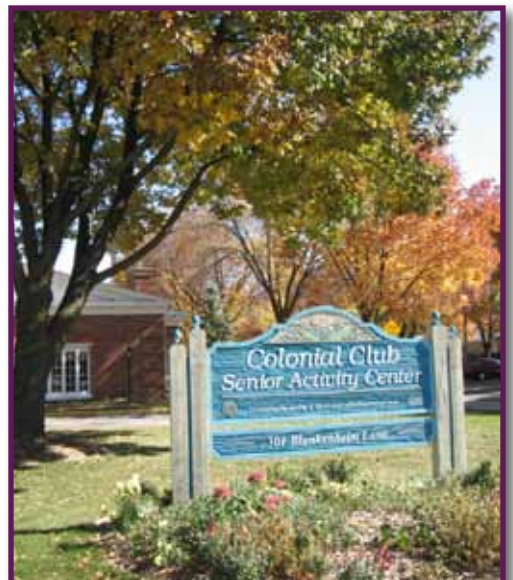
September & October of 2010 brought magnificent color to the Colonial Club.