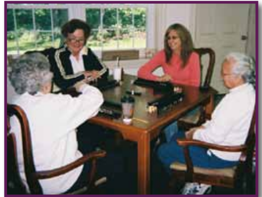
Mahjong became a favorite pastime for many. This foursome was pictured at one of their regular games in July of 2010.