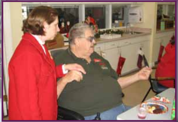
As always, December is filled with holiday gatherings like this one held in the Adult Day Center.