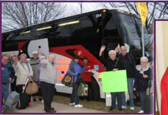
A group of Colonial Club travelers left Sun Prairie on a crisp November morning bound for Branson, Missouri.