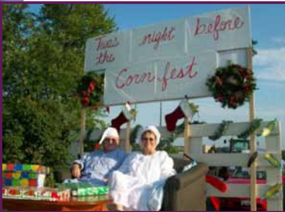
August of 2010 found the Colonial Club participating in the annual Cornfest parade and capturing 1 st place with their entry, "Twas the Night Before Cornfest".